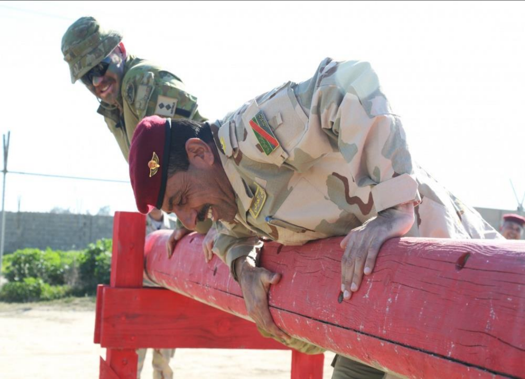
An Australian soldier with Task Group Taji navigates an obstacle course with his Iraqi partner, Camp Taji, Iraq, Feb. 17, 2016.