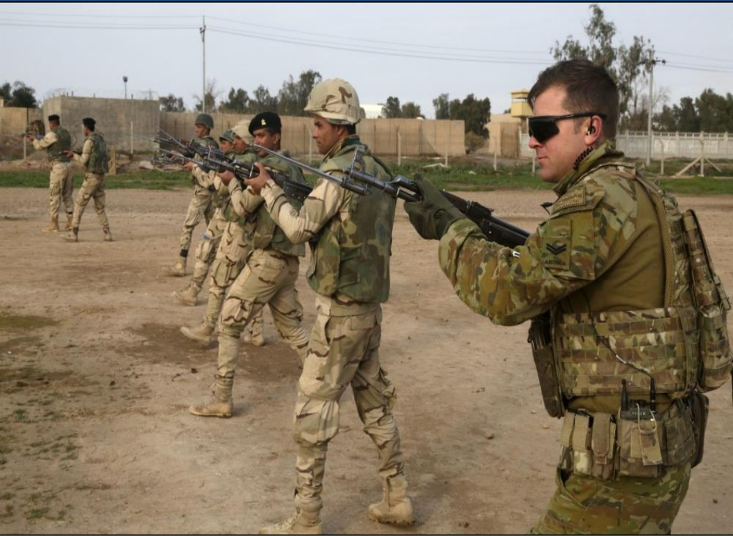
An Australian soldier with Task Group Taji conducts bayonet training with ISF partners at Camp Taji, Iraq, Jan. 3, 2016.